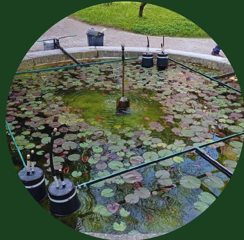
03/ Nymphaeae Sonorae (16 sounds)