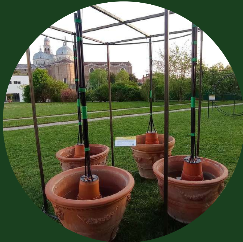
01/ Sonus Temporum (4 sounds)