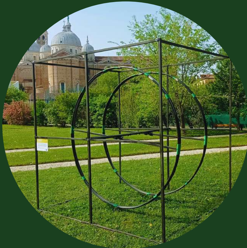
02/ Cunabula Sonorum (8 sounds)